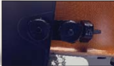
Plastic Instant-Release for Welding Helmet