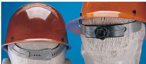
Staz-On® and Fas-Trac® Ratchet Suspension Systems