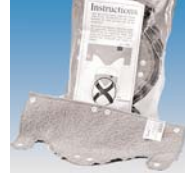
Custom Terri-Band Sweatband

Fits all MSA helmets. Provides excellent absorption, is easily washable and has no metal parts. Offers great fit and comfort.