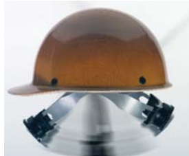
Skullgard with Swing-Ratchet Suspension